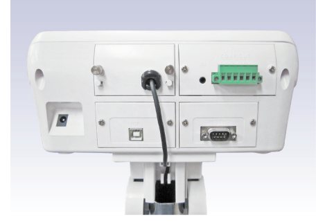
Display unit with HVW-02CB, HVW-03C, and HVW-04C

*7 For communication with a PC only. The driver software can be downloaded for free.