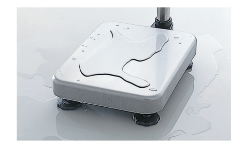
IP65 base unit with a SUS430 pan

The base unit can be washed with water, not to mention that wet objects can be weighed with no problem. Further, the surface of the pan is resistant to chemicals, scratches and rust, and easy to keep clean and hygienic.